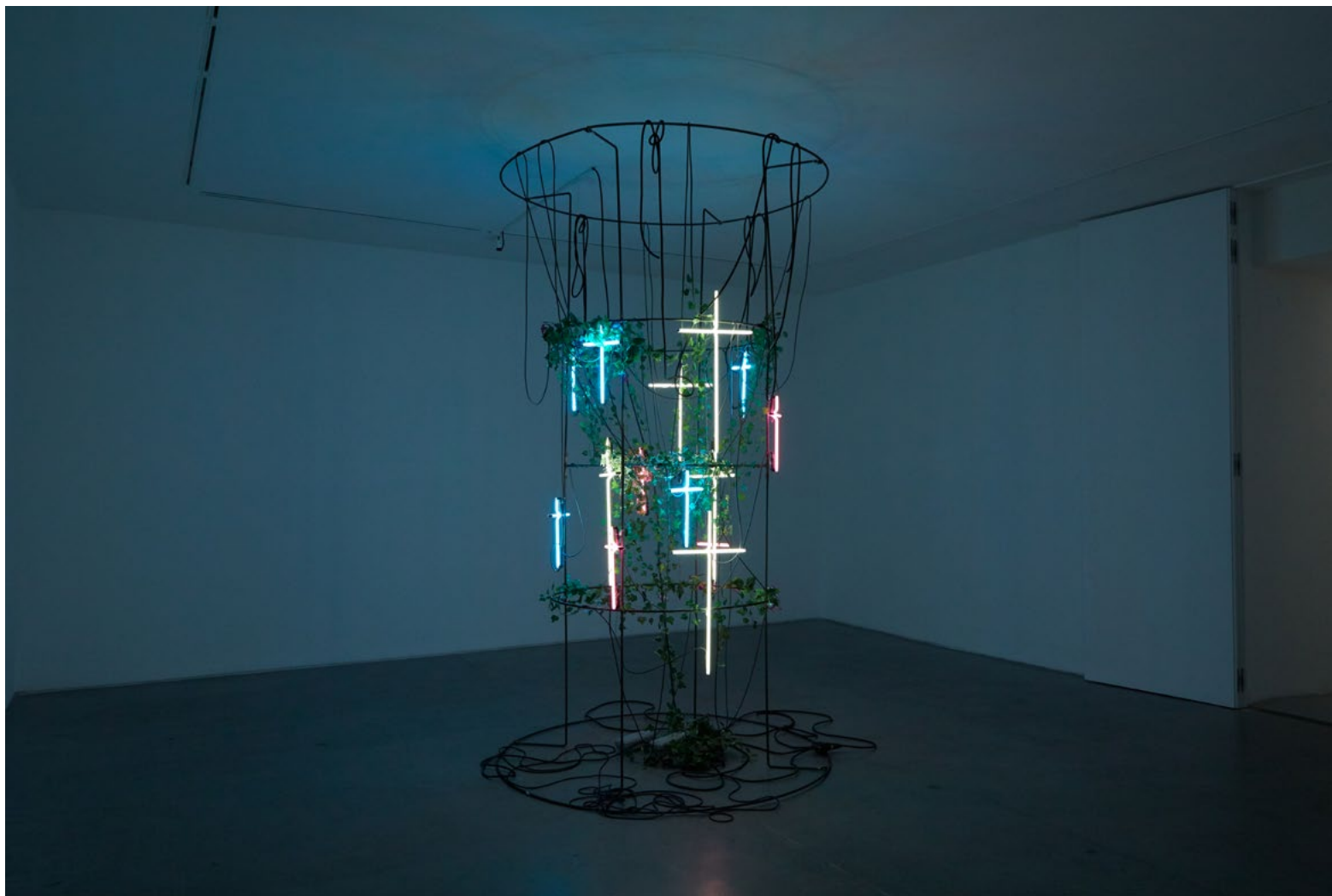
Have You Accepted Christ as Your Personal Savior? , 2019 Neon signs, steel structure, artificial plants (This door can be installed indoors or outdoors) 320 x 180 x 180 cm Unique piece

Exhibition view, Moths Drink the Tears of Sleeping Birds , VNH, Paris, 2019