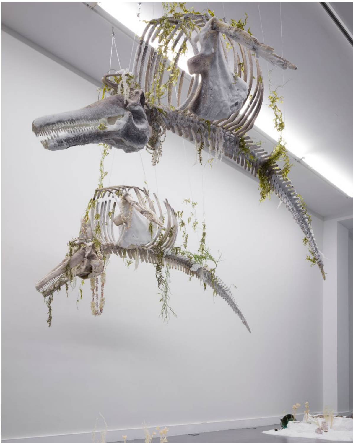
Red List Hector's Dolphin (The Fall and Rise) and Red List Amazon River Dolphin (The Fall and Rise) , 2021 Two resin and fiber glass dolphin skeletons, dry plants and pearl necklaces crystallized in salt 230 x 110 x 50 cm each Unique pieces

Exhibition view, Underland , mor charpentier, Paris, 2021.