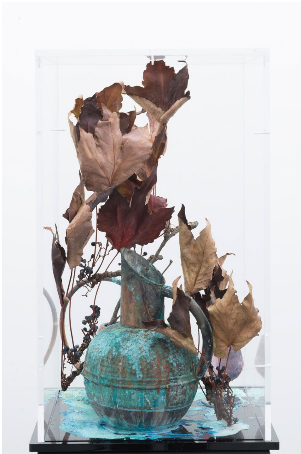
Bloom , 2017-2021 Series of mixed-media installations inside plexiglas vitrines, on wooden plinths 130 x 30 x 30 cm each Unique pieces

Courtesy of the artist and mor charpentier