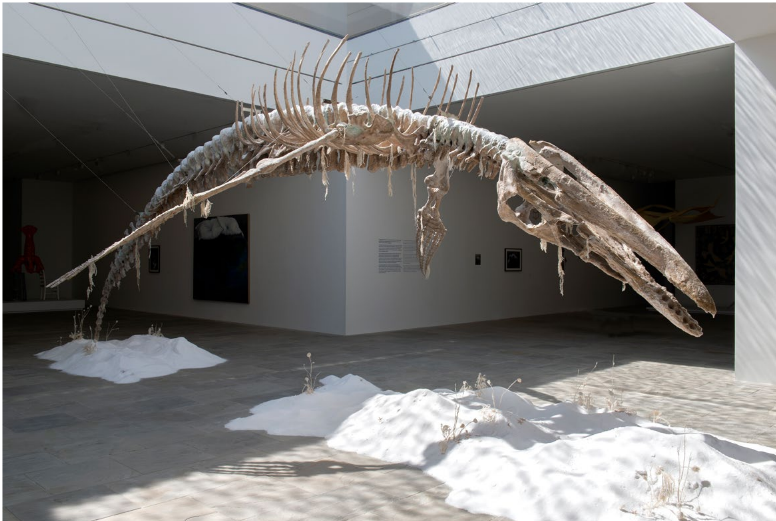
The Fall and Rise , 2021

Resin and fiber glass whale skeleton, salt and other minerals