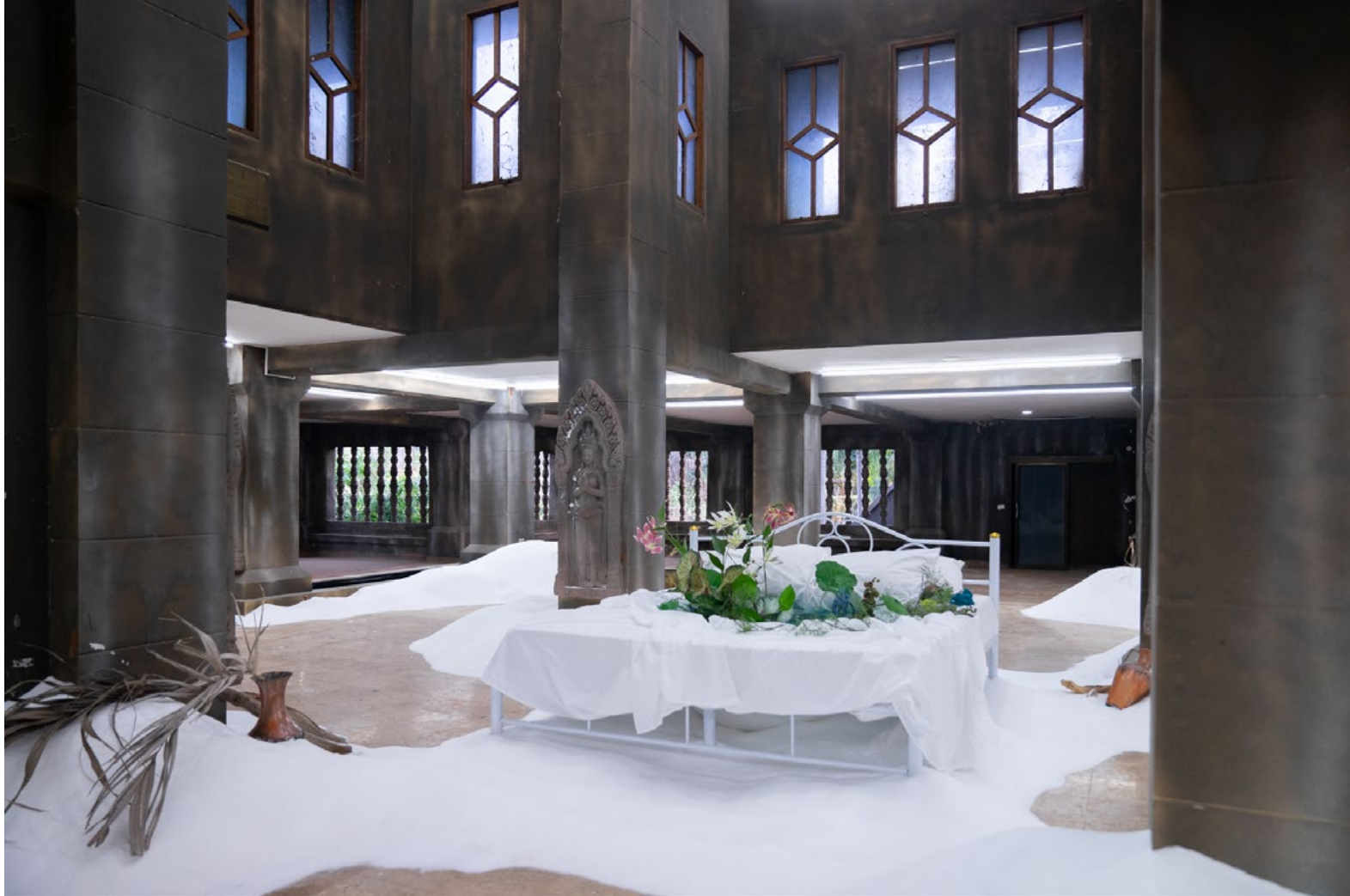
The Antechamber (Thai Crane), 2021

Site specific installation with various objects and materials including a bed changed into a pond filled with flowers and salty water, 6 tons of unrefined salt Variable dimensions (can be adapted to the exhibition space) Unique piece