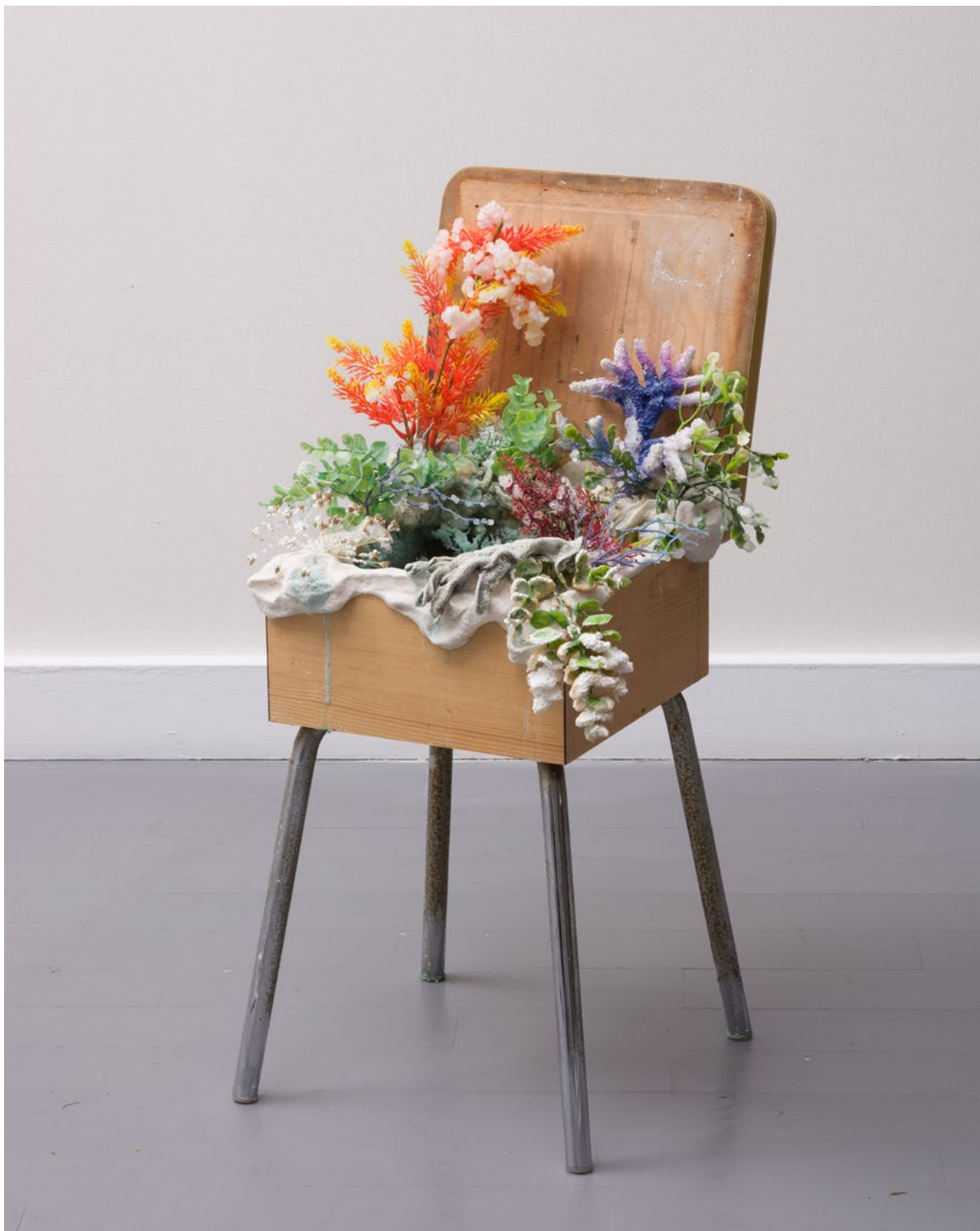
The Wishing Well IV, 2021

Small chair, salt dough, artificial plants, various objects and salt water