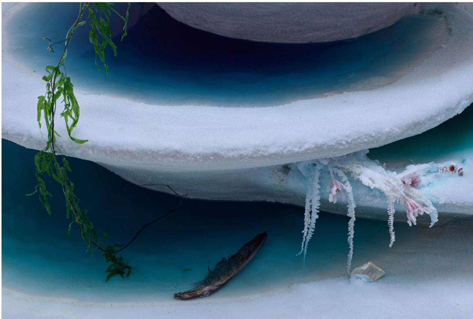
The Daydream , 2021

Site specific installation with resin sculpture, colored water, dry plants, and various objects crystallized in salt