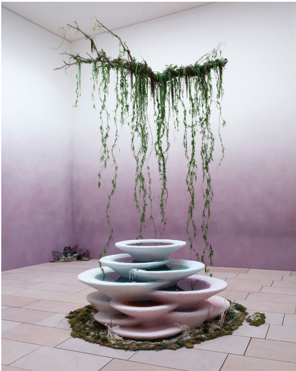
The Daydream , 2021 Site specific installation with resin sculpture, colored water, dry plants, and various objects crystallized in salt Sculpture: 180 x 200 x 110 cm Unique piece

Exhibition view, The Daydream , Open Space #8, Fondation Louis Vuitton, Paris, 2021