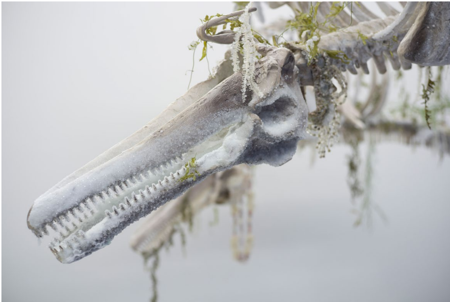
Red List Hector's Dolphin (The Fall and Rise) and Red List Amazon River Dolphin (The Fall and Rise) , 2021 Two resin and fiber glass dolphin skeletons, dry plants and pearl necklaces crystallized in salt 230 x 110 x 50 cm each Unique pieces

Exhibition view, Underland , mor charpentier, Paris, 2021.