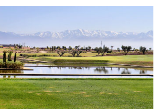
MACAAL Museum, Janine Gaelle and AL Maaden Golf Club with view of the Atlas Mountains

1:00 pm . Departure by van to visit the MACAAL , the Museum of Contemporary African Art located at the Al-Maaden Golf with impressive gardens designed by Fernando Caruncho and his sculpture park. Lunch at the golf club . (Independent payment, reservation by Around Art). macaal.org/en