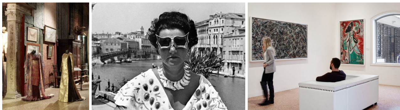
Palazzo Fortuny, Peggy Guggenheim and her museum