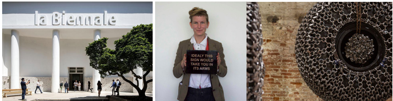
Biennale Central Pavilion, Laure Provost and Arthur Jafa's work at the Biennale

Note: Your Biennale ticket will allow you to re-enter and continue the visit.