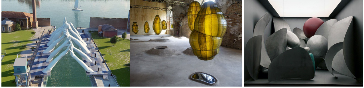
Arsenale, Biennale 2019